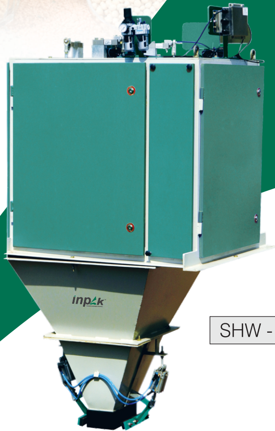
SHW - 10